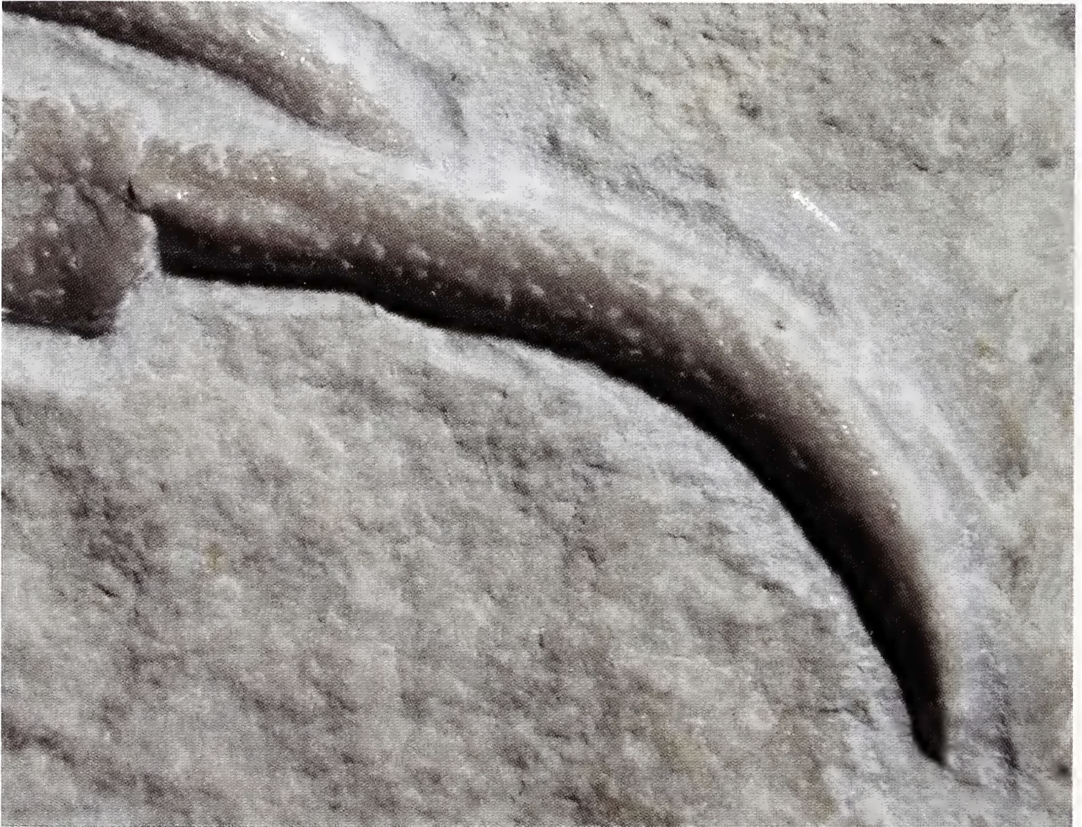
Fig. 8 – Striadiogenes frigerioi n. gen., n. sp., dactylus of P3 / dactylus di P3 (x 7.5).